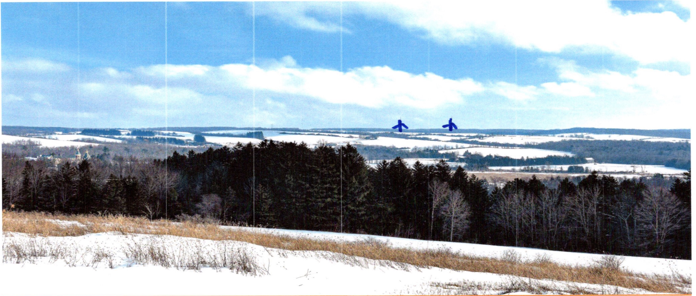
Photo 20 - Overlook near Holy Trinity Monastery EXISTING CONDITION