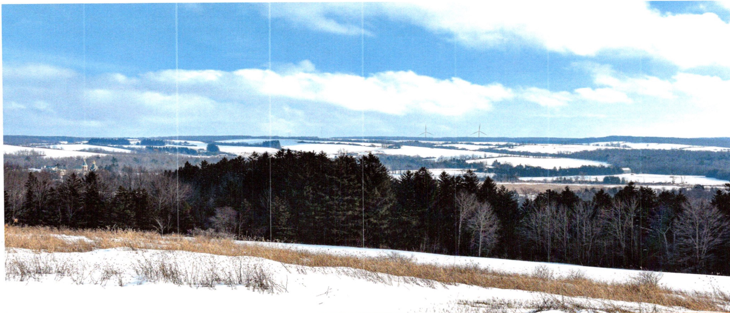
Photo 20 - Overlook near Holy Trinity Monastery EXISTING CONDITION